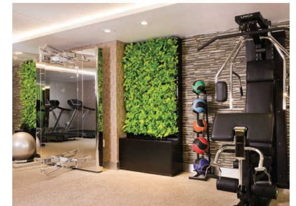
The Fitness Center