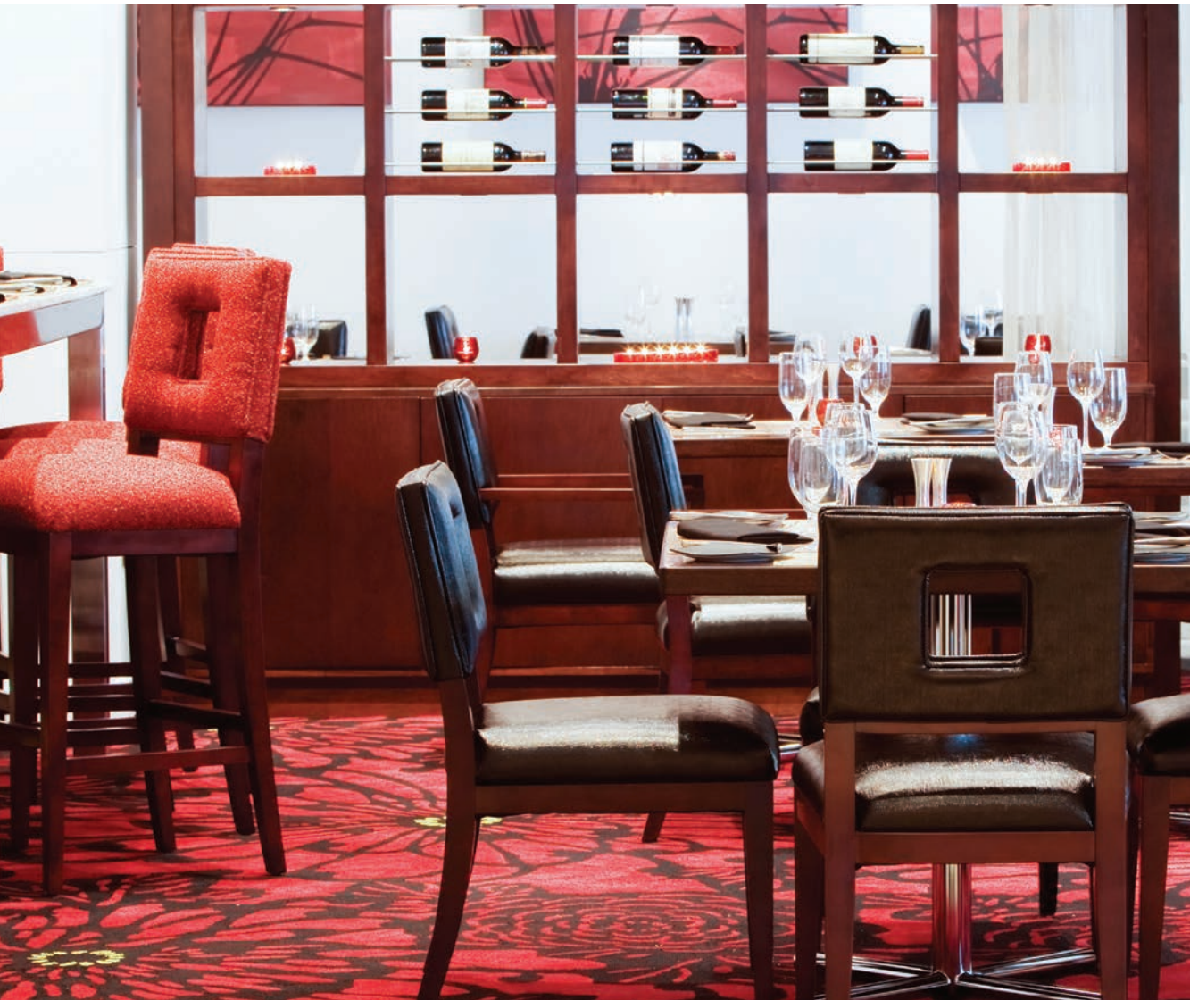
iCi Urban Bistro